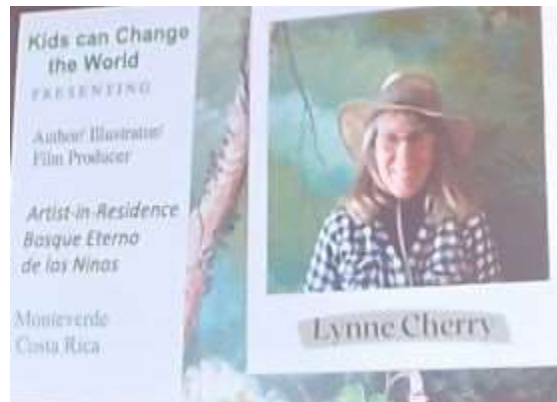
Lynne's introductory slide for her MFS presentation.

One of the visitors to Monteverde this month is Lynne Cherry well known and best selling children's author, illustrator and environmentalist. Our teachers and some students immediately recognized her name, having read and perhaps owned her books. Lynne is the Artist-in-Residence at the nearby Bosque Eterno de los Ninos Reserve, so we were delighted that she was willing to make a presentation to our younger students.